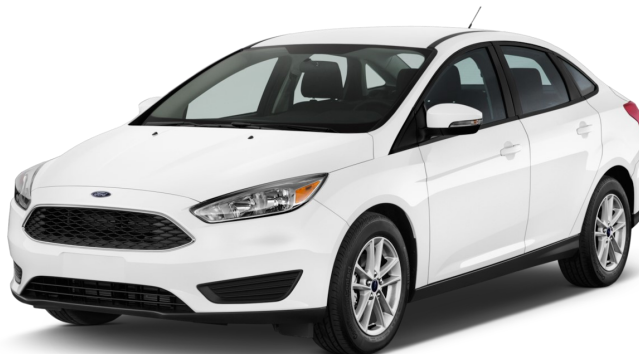
2018 Ford Focus