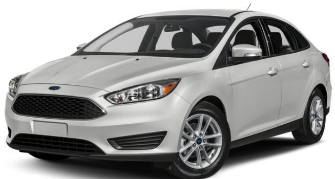
2018 Ford Focus