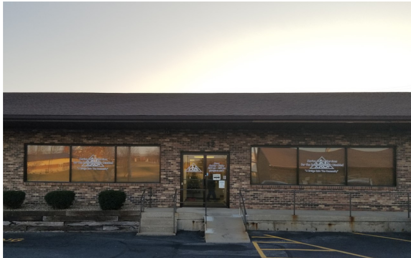
12 Northport Plaza, Hannibal